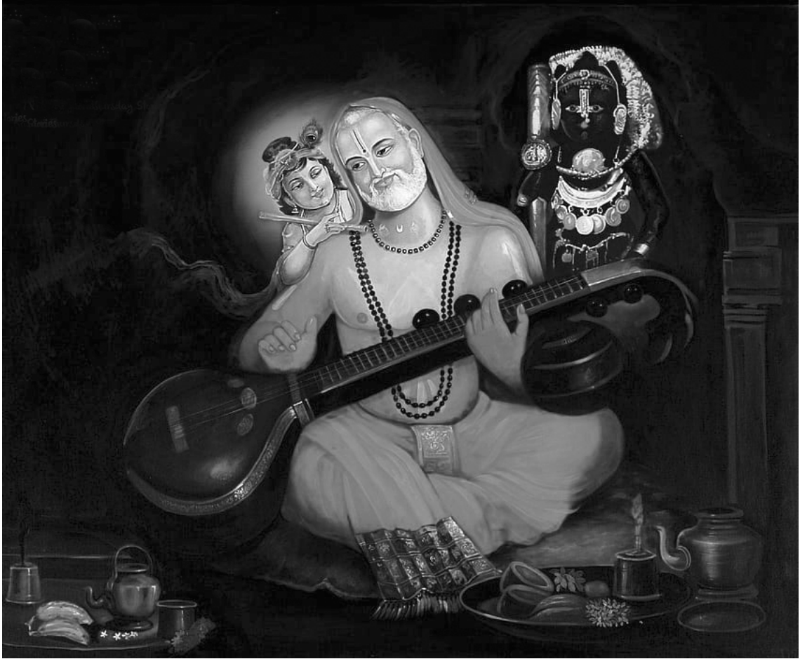
HH SRI RAGHAVENDRA TEERTHA SWAMYJI